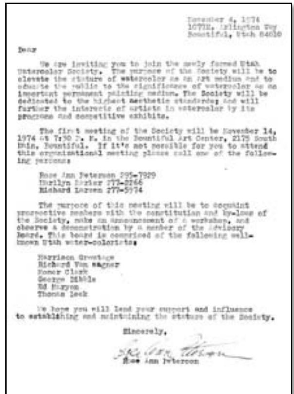
UWS recruitment letter sent out in 1974