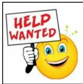
Image sources: public domain. Copyright belongs to photographers/designers

The Society needs volunteers like you! Every position will eventually need a replacement! What talents might you be able to share? Let one of the UWS Board members know if you are interested in learning about a specific position.