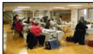
Students at Tom’s workshop