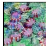
"Peppermint Series #3"