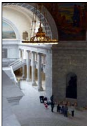
Critique at Capitol Paint Out

Oh WOW! This month's paint out at the Capitol Rotunda was so amazing! We arrived just as a concert choir was beginning a beautiful program. The acoustics were incredible, as the sounds of Christmas circled around while we painted. It really was a "moment" of creativity. The 10 of us rose to the challenge of capturing the architecture of granite staircases, columns and dome of light; So many compositions for future paintings. This is a "must do again" location for another paint out.