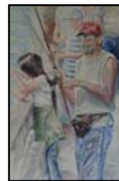
Painting by Chris Englund

Chris Englund will be exhibiting approximately 30 of his most recent watercolor paintings in conjunction with the first Downtown Provo Art Stroll of 2015. The exhibition which is scheduled to open on January 2 and run through March 1 will be held in the Eccles Gallery.