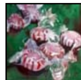
"Peppermint Series #1"