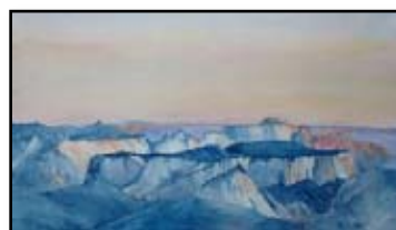
Kolob Terraces