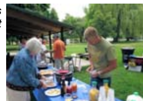
Small Works Show breakfast