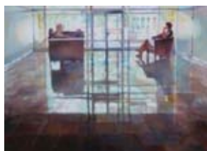
Considering 1545 Avenue Du Doctuer-Penfeld by Colleen Reynolds