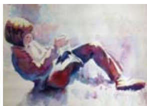
Bubblegum by Colleen Reynolds