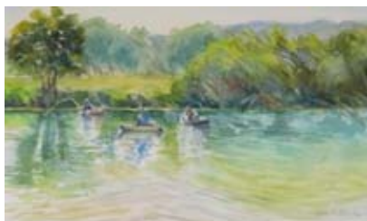
Morning at the Wellsville Pond by Jill Bliesner