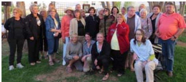
The 2014 UWS "gnat fighters" of Arts & the Parks: Light on the Reef