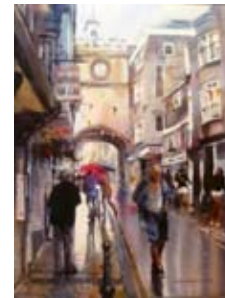
Totnes by Kristi Grussendorf