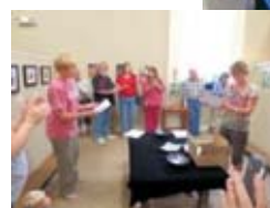
Small Works Show Awards Ceremony

CVC Member Meetings are held the second Tuesday of each month at the Logan Library.