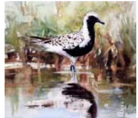
Two plein air paintings by Kimberly Roush