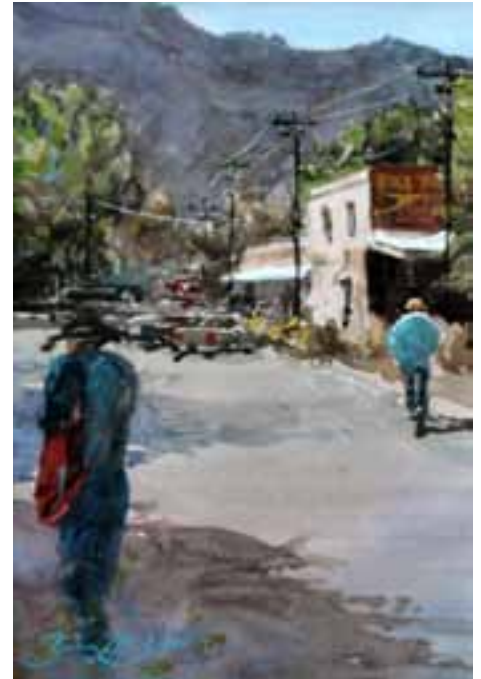
"The Bike Shop" By Brienne Brown